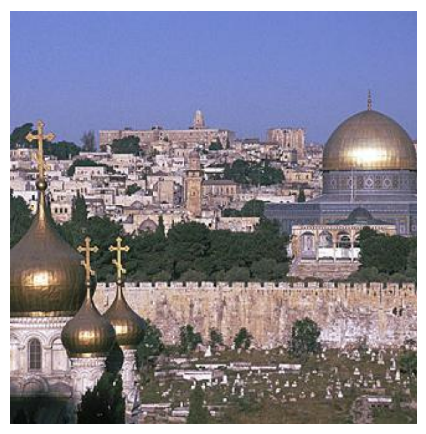
A God by any other name?