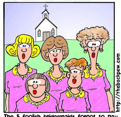
The 5 foolish bridesmaids forgot to their electric bill, their alarm clock did not go off, and the wedding was missed.