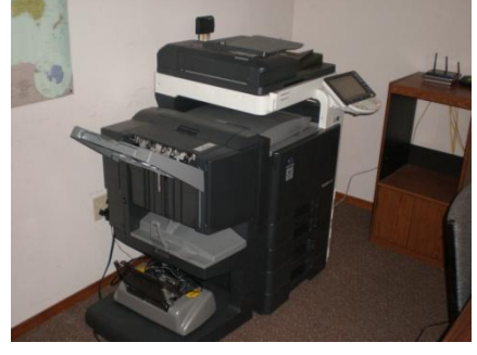
Our Konica Minolta Bizhub C353 has been in service for 5 months.

About five or six months ago, we obtained a new Bizhub C353 color copier/printer, which also has the capability to fold and staple. This new machine made it easier to expand our printing and