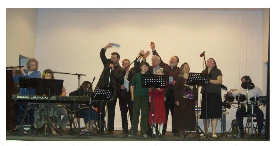
Saints from the People of Truth in Paden, Okla. participate in the Paden Gospel and Bluegrass singing on February 6th. Paden hosts the singing every other week at the auditorium.

Take the dearest things from me If that's how it must be To draw me closer to thee.